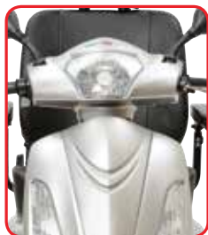
Front LED Light Package