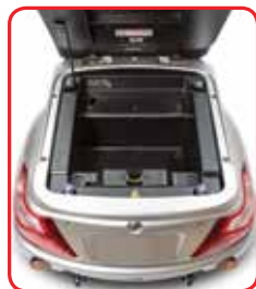
Under Seat Storage

Soar into Adventure with the Pride® Raptor!