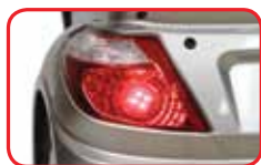
Rear LED Light Package