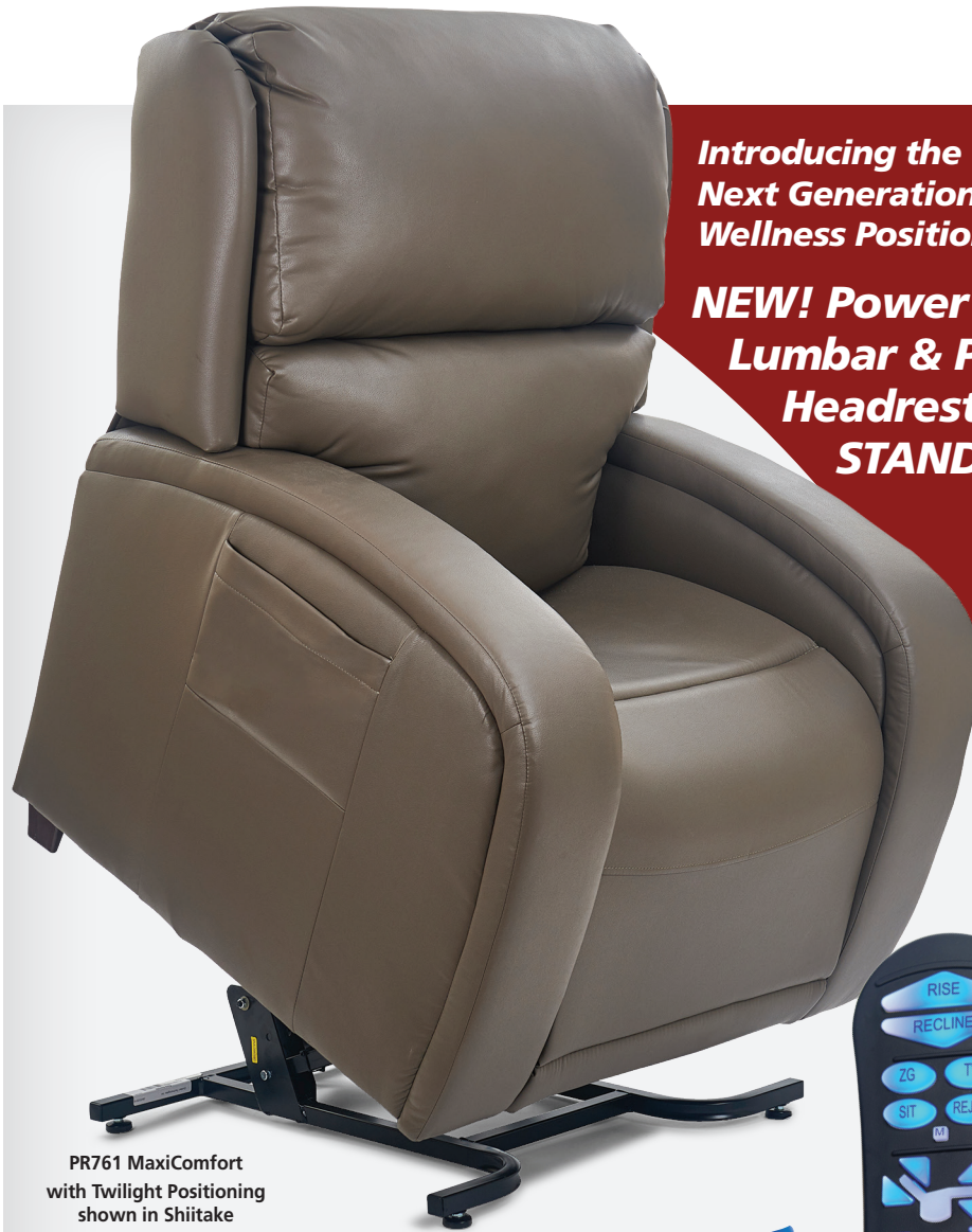
PR761 MaxiComfort with Twilight Positioning shown in Shiitake

Introducing the Next Generation of Wellness Positioning